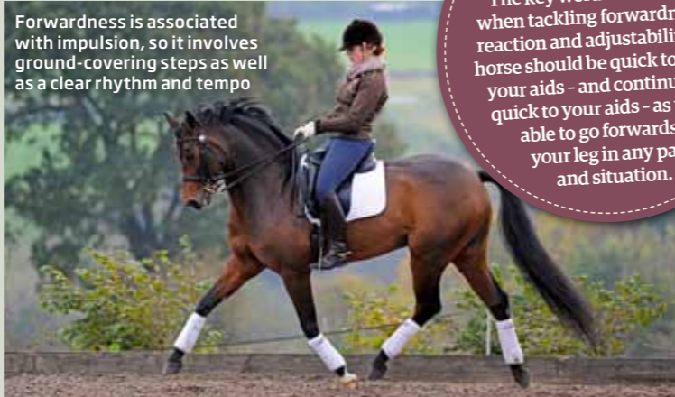
Forwardness is associated with impulsion, so it involves ground-covering steps as well as a clear rhythm and tempo

"It's important that when a horse moves forward he stays in balance and doesn't drop onto his forehand. He also needs to create a moment of suspension, which should come from the thrust and release of energy stored in his hind legs."