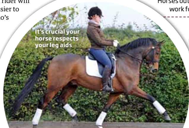
It's crucial your horse respects your leg aids

"However, forwardness shouldn't be confused with fizziness. It's not just about your horse moving in a forwards direction off your leg really fast, it's about him moving energetically off your leg in any direction. A rider will always find it easier to sit to a horse who's forward - if he's not in front of your aids everything you do with him will be compromised."