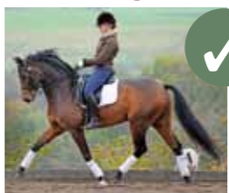
Horse working forward correctly