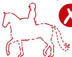
Horse not working through properly